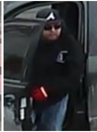
Suspect #3 (Driver)